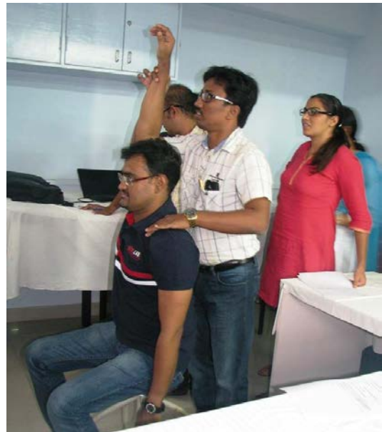
(Right) Post-conference workshop