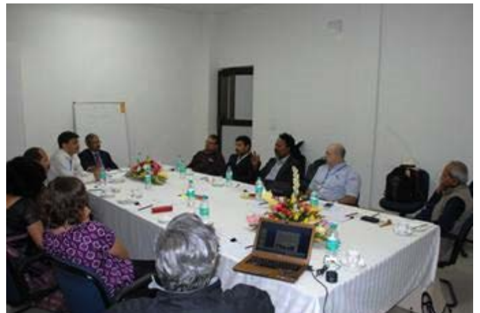
Panel discussion on activities of Design Innovation Center