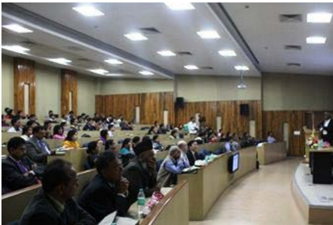
Plenary session lecture