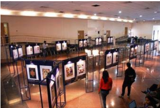
Exhibition of students' design work