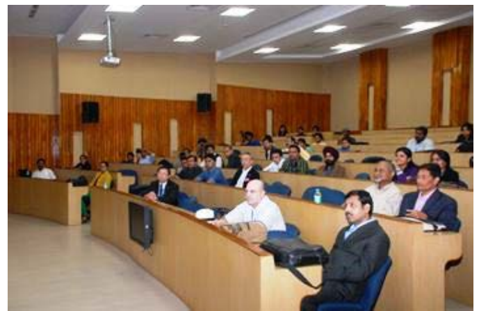
Participants in a session