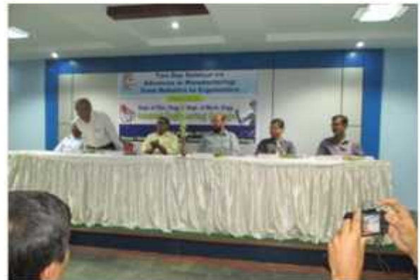
A view of the dais during the inauguration