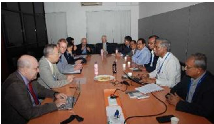
ISE Meeting with IEA members