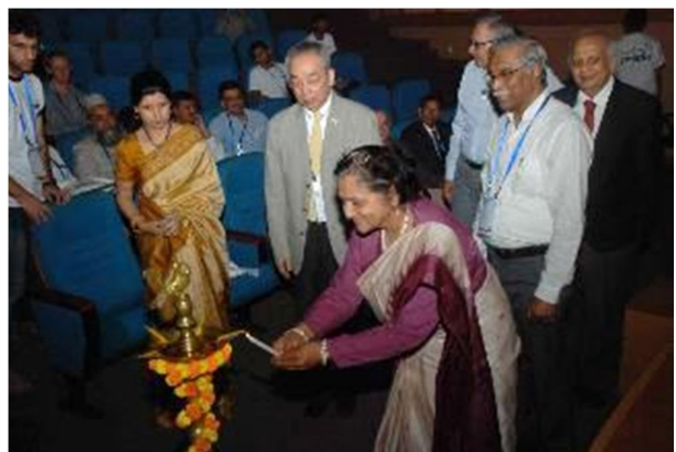
Inaugural Ceremony HWWE 2015